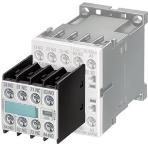
AUXILIARY SWITCH BLOCK, 53E, 1NO+3NC, DIN EN50011, SCREW CONNECTION, FOR CONTACTOR RELAYS, 4-POLE

Number of NC contacts / for auxiliary contacts