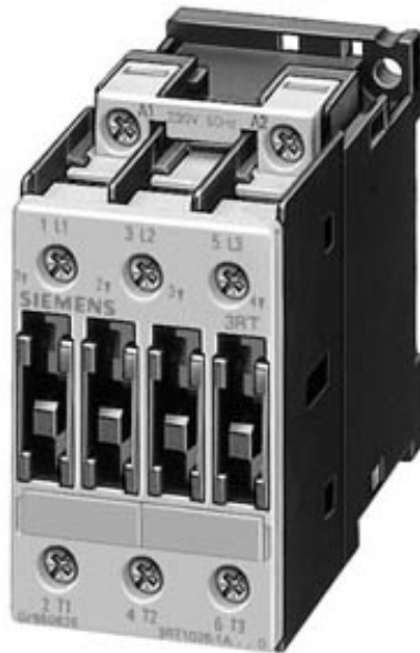
CONTACTOR, AC-3 7.5 KW/400 V, AC 110V 50/60HZ, 3-POLE, SIZE S0, SCREW CONNECTION