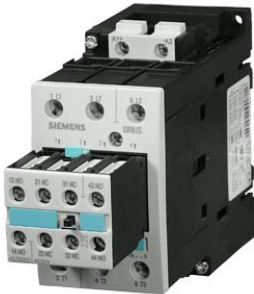
CONTACTOR, AC-3 15 KW/400 V, DC 24 V, 3-POLE, 2 NO + 2 NC, SIZE S2, SCREW CONNECTION