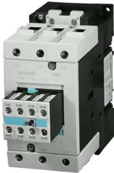
CONTACTOR, AC-3 37 KW/400 V, AC 230V 50/60HZ 2 NO + 2 NC 3-POLE, SIZE S3, SCREW CONNECTION